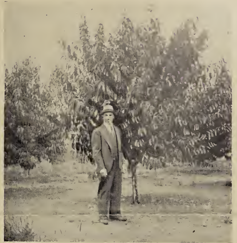
This young Pacific Gold tree in our orchard at Buckley produced five and one-half boxes of fine big peaches, the fourth year from planting.

ORDER NOW! SHIPPED WHEN YOU WANT THEM. Use This Order Blank